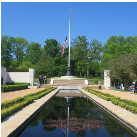
► Reflecting pool at Madingley American Cemetery.