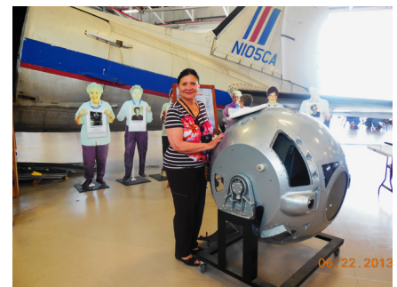
Warner Robbins - June 2013