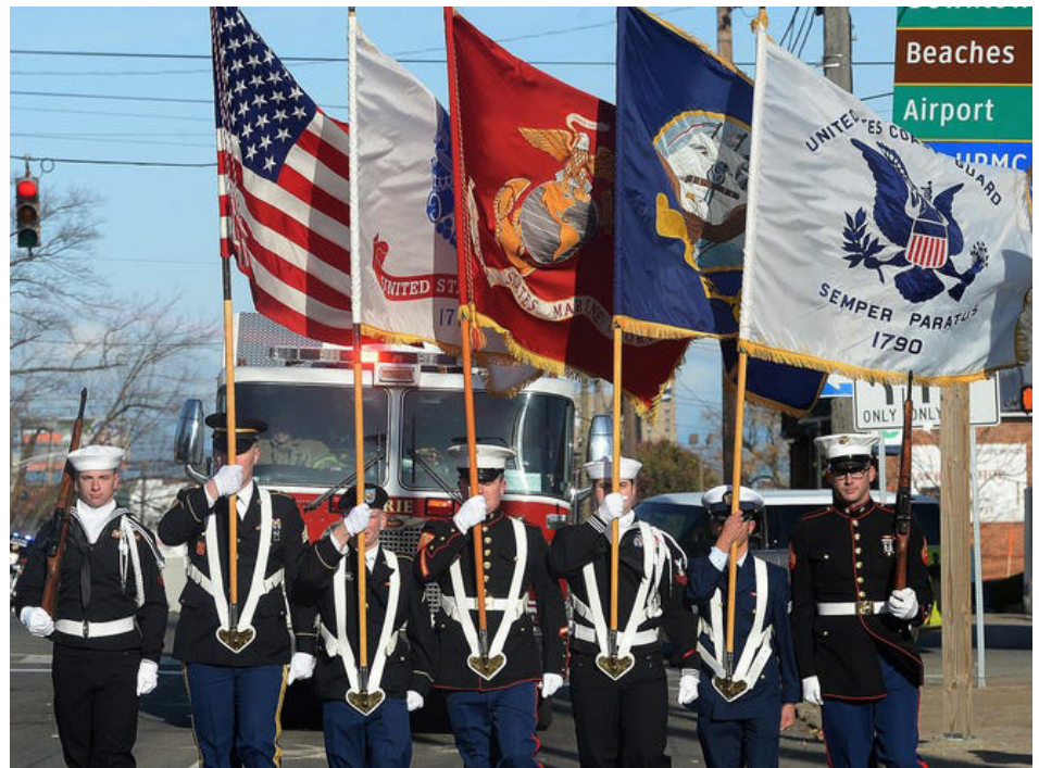
Happy Veterans Day to all Service Members (Past and Present) & their Families!