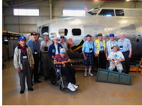
Reunion Memories Warner Robbins - June 2013