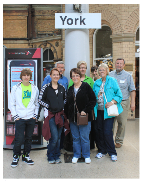
► An excursion to York, England