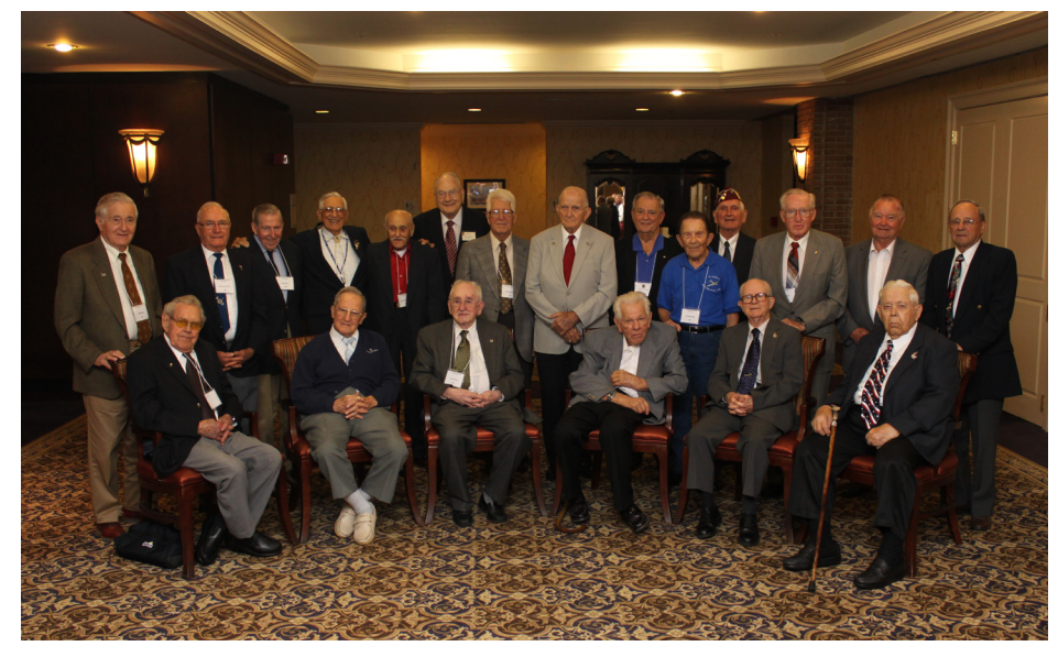
▶ Pictured here are twenty of the airmen from Glatton who attended the 2011 State-Side Reunion.