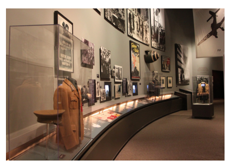
► Touring the Mighty 8th Museum.