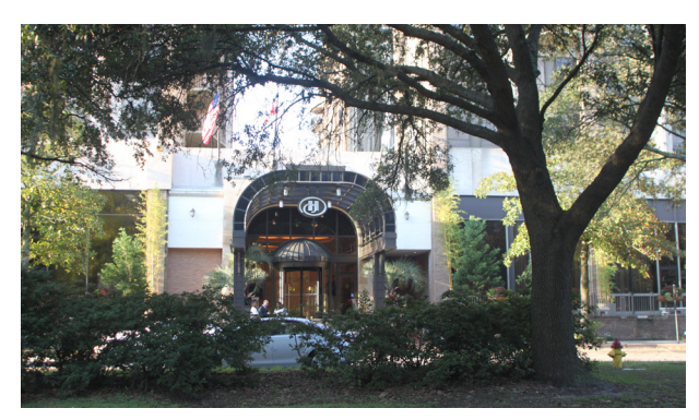
► The Hilton Hotel Savannah