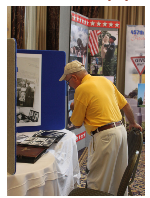
► Memorabilia room.