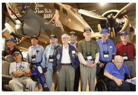
Our WWII Veterans pose in front of the B-17, "Shoo Shoo Shoo Baby", at the Wright Patterson Air Force Base and Museum.

the doors were opened to the public, and the men were given a close-up inspection of the B-17 aircraft, the 'Shoo Shoo Shoo Baby'. Each of the men took the opportunity to enjoy reminiscing about the old days, providing personal accounts of the jobs assigned to each man on their aircraft.