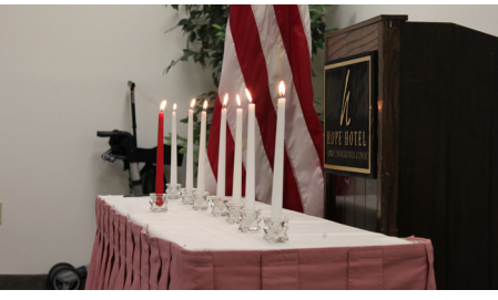
> 2013 Memorial Service

This year, during our State-side Memorial Service, we honored 48 WWII Veterans who passed away.