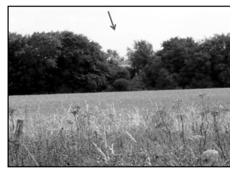
The gap in the trees can still be seen today

The subsequent accident report shows that the accident was "attributed to the fact that the pilot was lost and let down in an area 500 feet more above sea level than the field of intended landing." The report attributed "75% responsibility to pilot error and the remaining 25% to the weather". 43-38812 was declared as 'salvage' on