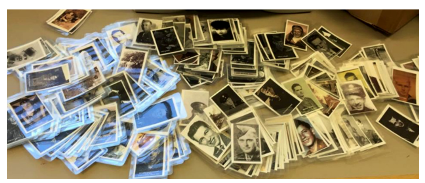
▶ These photos are ready to go on the Wall of the Missing next May. Larger photos will be placed in front of the grave markers.

I also posted an inquiry on the WWII 457th Bomb Group facebook page. If you recognize him, please post it to facebook and I will contact you!