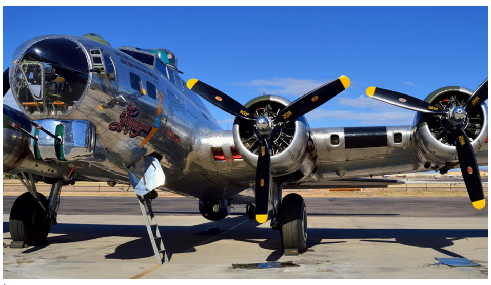
Arizona Commemorative Air Force Museum