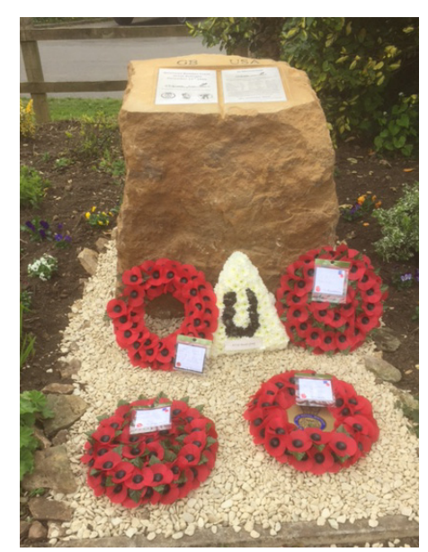
Wreaths adorn the newly unveiled monument