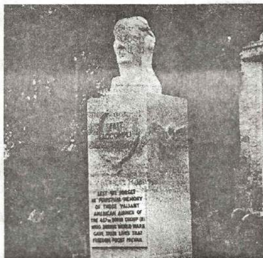
Monument to the 457th Bombardment Group.

The 457th was formed in 1943 and flew missions over Berlin, Germany, seven times, and raided Gdansk, Poland, as well.