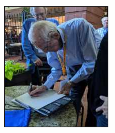
The Theme of this year's reunion was: "Victory In Remembrance"