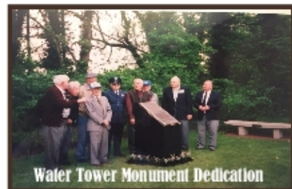
Water Tower Monument Dedication

Love to you all ... Will & Adele